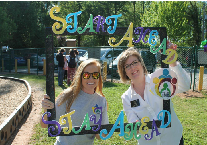
Talk to Me