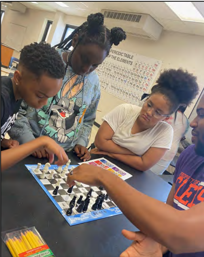
Campers in the summer of 2023 learned math and logic skills by playing chess. Students had class time daily, as well as field trips, guest speakers, crafts and community service.

Over the past year, KNOW(2) has established a new Educational Task Force to review information about needs in the community and to seek new opportunities to influence and encourage greater educational attainment and training for every local resident.